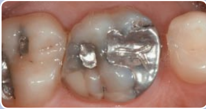
Tooth-Colored Restorations – Enamel-colored porcelain or composite resin restorations are now available to replace old conspicuous silver fillings.

Here are some cosmetic dental procedures that are available to improve your smile.