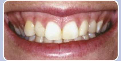
Gum Sculpting – Correct a too-gummy smile, make short teeth look longer, and make smiles more symmetrical. (The image below includes veneers.)