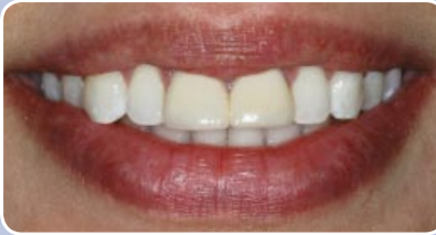
Veneers – Cover gaps & crooked, chipped, or discolored teeth with custom-made porcelain veneers that adhere to each tooth's surface.