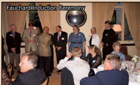
Fauchard Induction Ceremony

The practice of dentistry at that time had been stifled by jealousy, because dental knowledge and techniques were regarded as valuable property by the more competent and skilled practitioners, and were rarely shared with other dental colleagues. In a significant break with tradition, Dr. Fauchard published a textbook in 1728 entitled Le Chirurgien Dentiste ou Traité des Dent (The Surgeon Dentist or Treatise on the Teeth) in two volumes of over 800 pages, which included many illustrations. In this way Dr. Fauchard shared his considerable knowledge and wealth of observations with colleagues and students, describing his techniques with exceptional clarity and detail. Many of his suggestions were radical for dental practice in those days, but his practice of seating patients rather than having them lie down is still used today. Additional information about the Pierre Fauchard Academy may be obtained at www.fauchard.org .